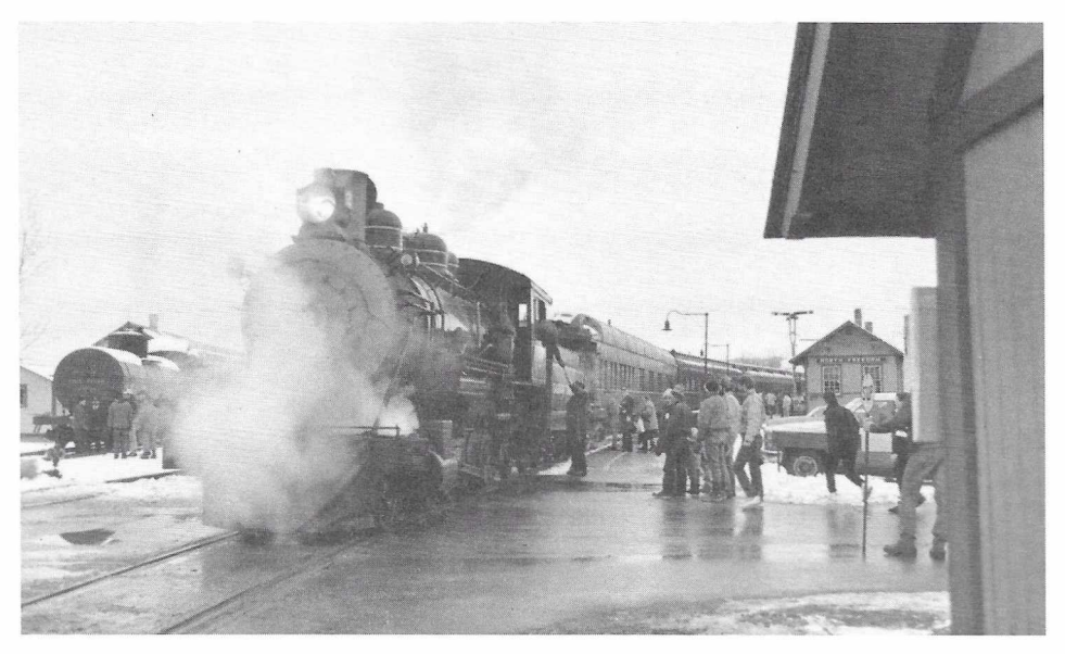
Saginaw Timber no. 2 is ready to leave North Freedom with the Snow Train passenger train.