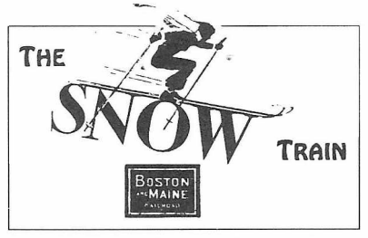
Illustration from a 1932 menu